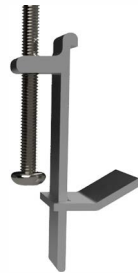
DEEP LUG MOUNT